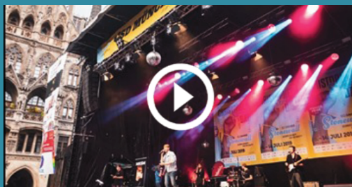
LIVE @ MUNICH PRIDE 2019