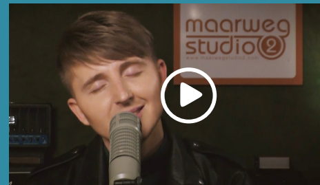
COLLIDE - ACOUSTIC SESSION RELEASE TBA PASSWORD: MKSM2021